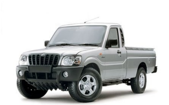
Mahindra Expected 2010

Mahindra is considering introducing a small hybrid-diesel truck .