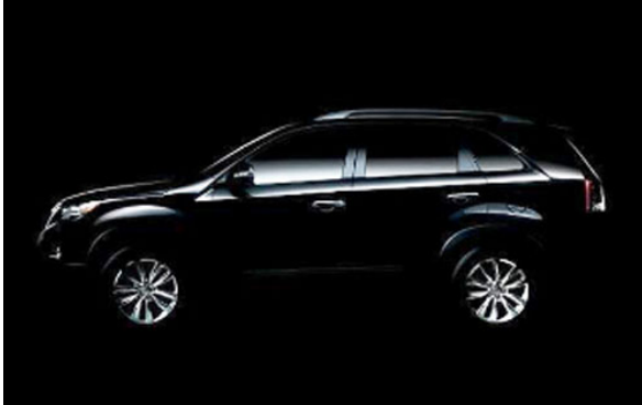
Sorento Expected 2010

A diesel powertrain system is expected on the 2010 Sorento as announced by Kia .