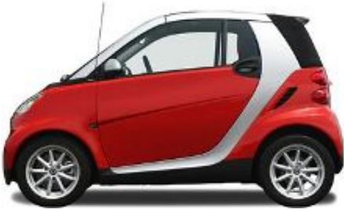
Smart Car CDI Expected 2010

Smart Car has been selling a diesel vehicle in Canada for three years. This community blog indicates that they may offer a version in the US by 2010.