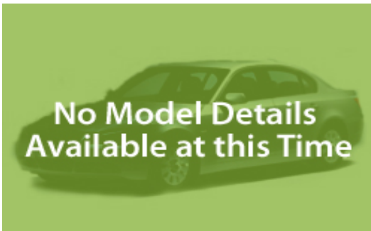
Subaru Impreza/Forester Arriving 2010

Forester and Impreza introduction planned for 2010.