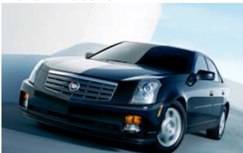
Cadillac CTS Sedan Expected 2010

GM may use their European CTS diesel in the US. Read more in Diesel Power Magazine .