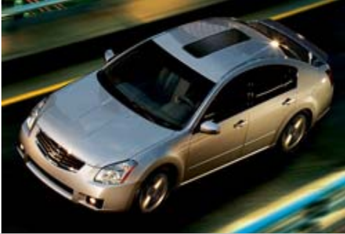
Maxima Sedan Arriving 2010

Nissan is co-developing a 50-state emissions compliant diesel engine with Renault. The company's announcement stressed diesel's potential to reduce emissions from several models offered by the company.