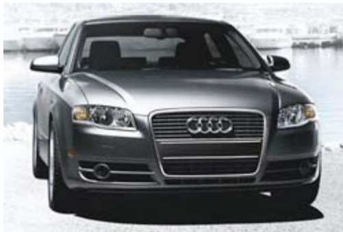
A3 Sedan Arriving 2010

AUDI Plans to offer an A3 TDI 1 st quarter of 2010.